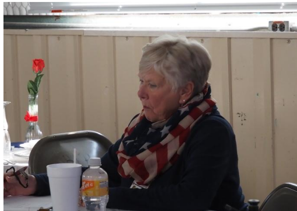
The Teams and the Score Keeper