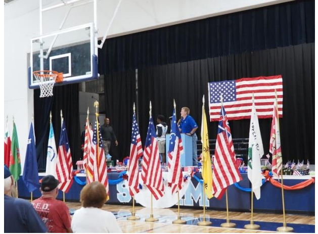
Army vs. Navy