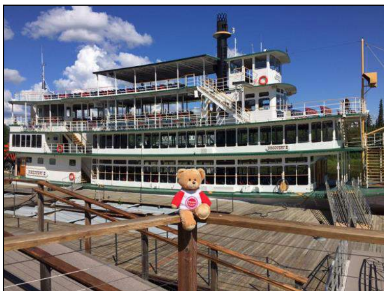
FAIRBANKS, Alaska - Stern Wheeler Discovery III "SMARTY" had the trip of a life time!

I hope you are all having a great summer with adventures and travels galore. Please be safe and well.