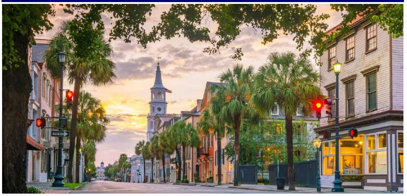
Beautiful and Historical downtown Charleston, South Carolina